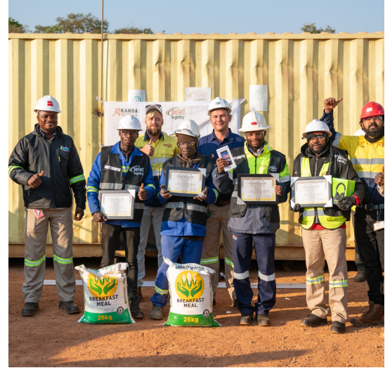
Four individuals were recognized for their safety practices during construction of Kamoa's smelter village accomodations.

Training and development remain vital pillars in ensuring the success and growth of our company. Upon the completion of these programs, employees will acquire the necessary skills to effectively apply them in their workplace, thereby facilitating their professional growth and advancement.