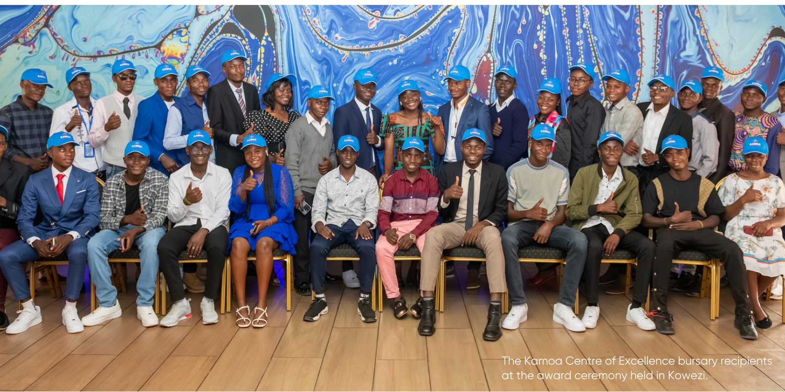
The Kamoa Centre of Excellence bursary recipients at the award ceremony held in Kowezi.

Committed to shared value and growth for all our stakeholders