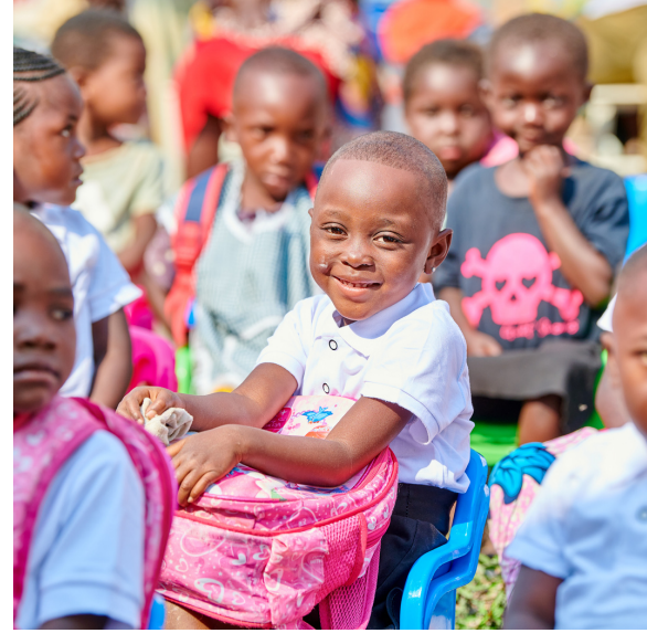
End of the school year celebration at the Early Childhood Development Centre in Musoka.