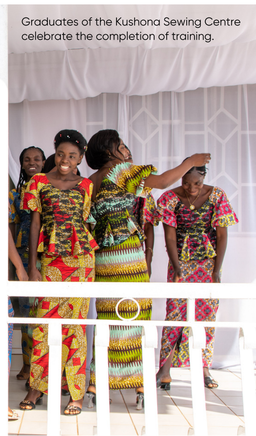
Graduates of the Kushona Sewing Centre celebrate the completion of training.