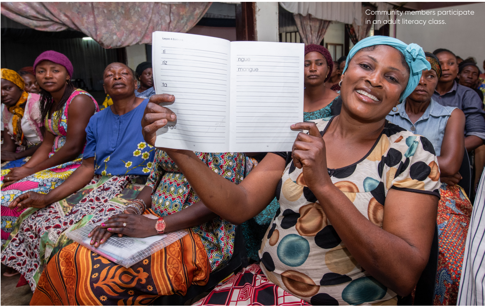
Community members participate in an adult literacy class.